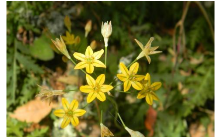
There were also a bunch of these flowers as well along the Shilling Lake Trail.

If you are interested in taking this hike yourself, from Hwy 280, go west on Sand Hill Rd. Go 5.6 miles, then right onto Portola Road. Follow Portola Road until it ends. Turn sharp left onto La Honda Rd/CA-84. Then go 1.7 miles. Thornewood Open Space Preserve, 825 La Honda Rd, Woodside, CA, is on the left. Drive through the brick entranceway and park in the parking area. We went down the Shilling Lake Trail as far as where the trail was damaged by a landslide this winter.