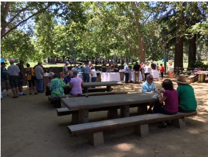
The beautiful Cuesta Park Picnic Grove.

What a great day! Hope to see everyone next year!