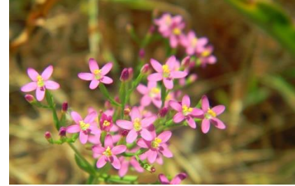
We saw these flowers in great profusion.