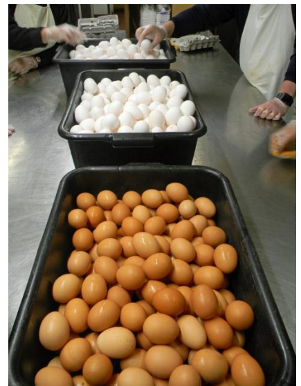
The white eggs were destined to become Easter eggs!

Volunteering at Padua helped us all get ready for our own holiday meals. It was a bit of work, but the camaraderie of fellow retirees made it most enjoyable.