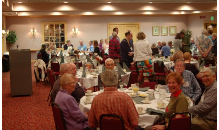
The crowd seated at Mariani's Restaurant.