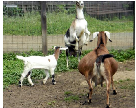
Wow! I wish that I could jump like that...

Length: About 2.5 miles. Duration: 1.5 hours. Difficulty: Easy. No dogs. Wheelchair accessible.