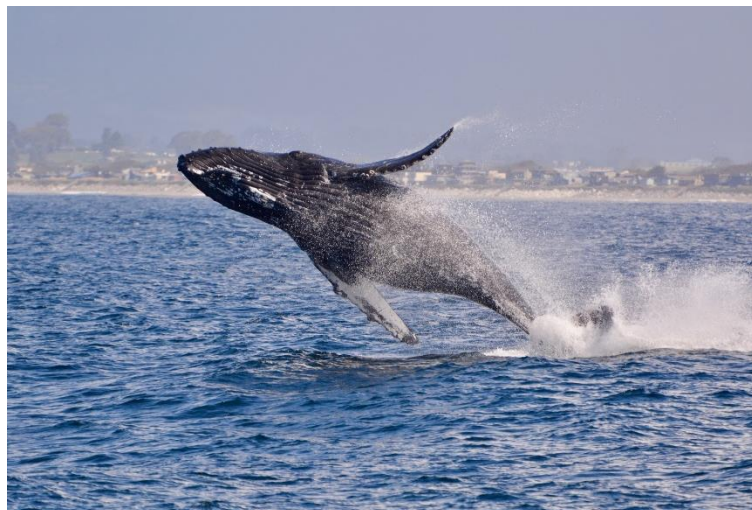
Big fin slapping.

After disembarking from the Sea Goddess, we had a simply wonderful lunch at Phil's Seafood Restaurant, which was almost across the street from the harbor. The fish (fresh Alaskan halibut) and chips were outstanding, and everyone seemed to enjoy the fare. The chatter about the whales made for a truly memorable lunchtime.