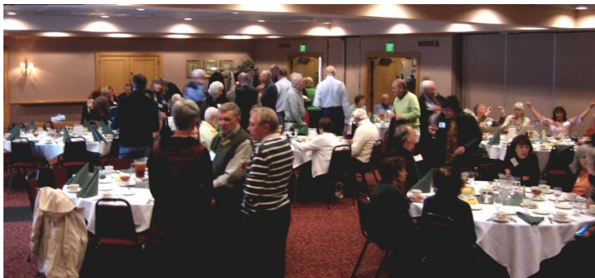
Guests socializing before lunch was served.