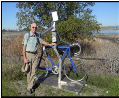
A fossilized Google bike?