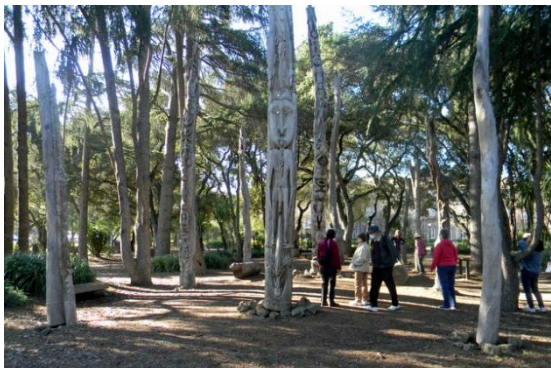
New Guinea Gardens

Thirteen lucky Lite Hikers enjoyed a stroll through the Stanford University campus on a beautiful January day. Beginning at the Cantor Arts Center, we walked between the David Packard Electrical Engineering Building and the William R. Hewlett Teaching Center (two separate structures) before passing the Terman site. We spent a few minutes admiring the New Guinea