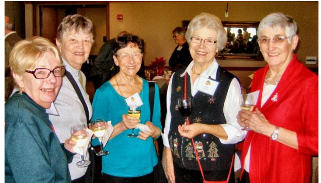
Former HP site nurses reminisce at luncheon.