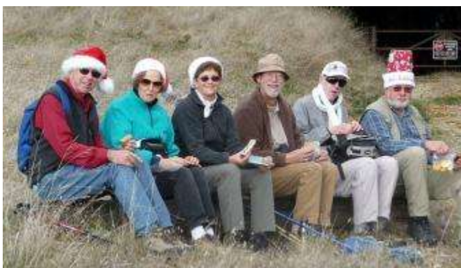
Santa's helpers and friends

A gentle slope with ample switchbacks led us to the summit, and after a short walk on Long Ridge Road, we came upon the Wallace Stegner Memorial Bench which afforded the group a good lunch spot. Stegner, a local writer, bought some of this land, which ultimately became this preserve. After lunch, we headed down and reconnected with Peters Creek Trail and back to our starting point